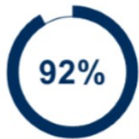
Year to Date (2018)

The average daily attendance rate; Year-to-Date, derived from student attendance data sourced from the school systems as at 03/04/2018