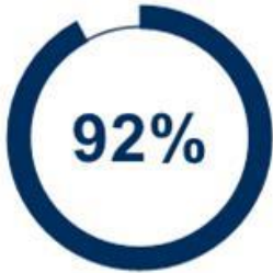
Year to Date (2017)

Our 2017 Attendance target is 96% or greater